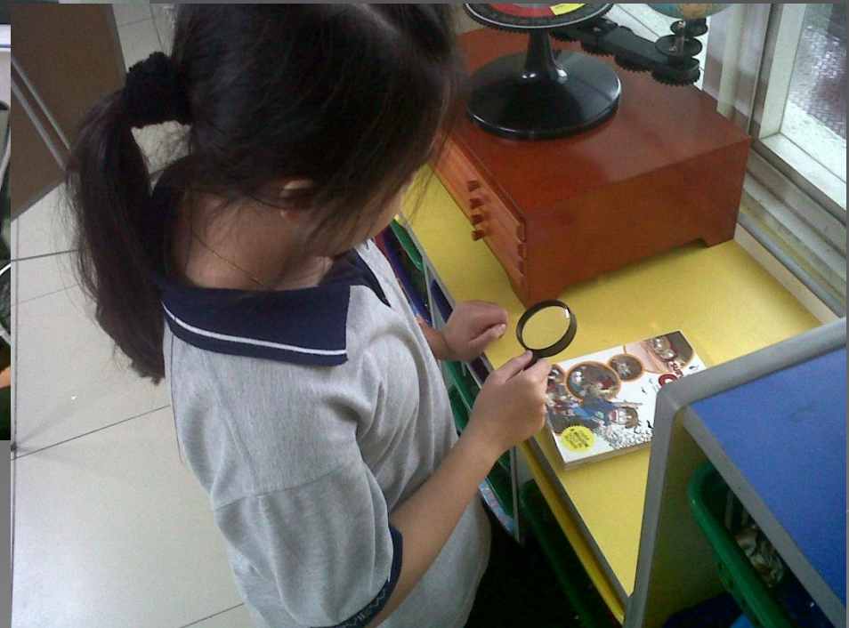
Critical Thinkers and Evaluators